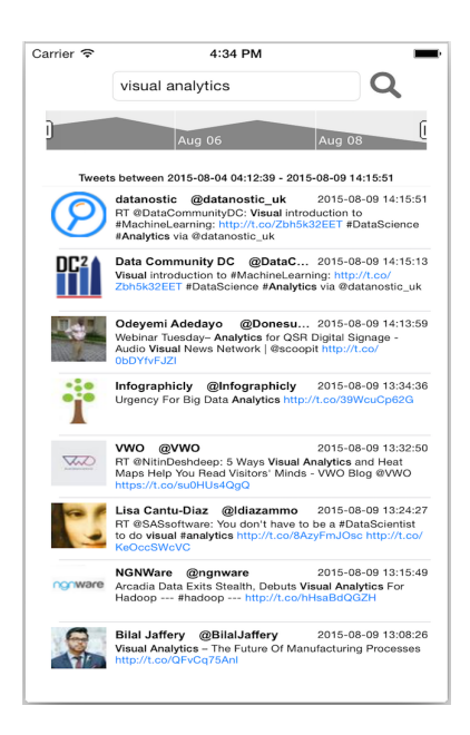
Figure 1: The simple search mode provides a query box and search results list, as well as a timeline visualization.

When the device is held in upright position (portrait mode) TwIST defaults to the simple search mode, with the primary interface elements following the query box and search results list paradigm (see Figure 1). This orientation provides more vertical than horizontal space, and is dominated by the list of tweets that match the searcher's query. The overall design is meant to replicate the search interface currently used by the Twitter app, but with some simple modifications and additions. Upon submitting a query, the app fetches the most recent 100 posts using the Twitter API [18], with the results sorted by their submission date and time (most recent first). These are displayed in a scrollable list, and include relevant metadata such as author information and date/time. In order to help the searcher to decide on the relevance to the query, any use of the query terms within the tweet contents